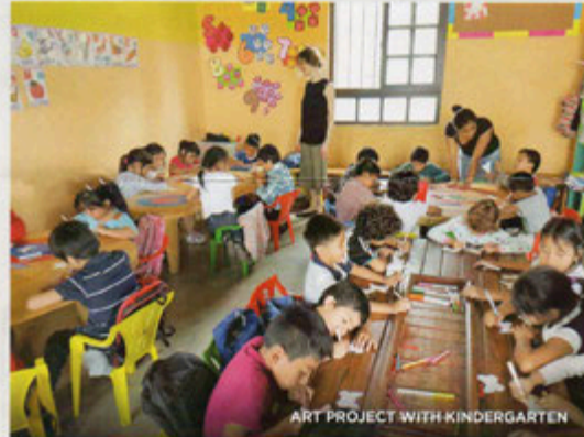
ART PROJECT WITH KINDERGARTEN

To augment the arts program, two volunteers from Give Kids A Chance conducted art workshops with every grade from kindergarten to Grade 8.