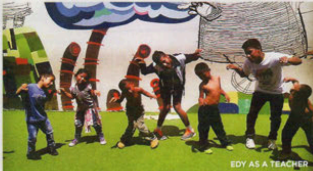
EDY AS A TEACHER