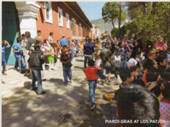
MARDI GRAS AT LOS PATOJOS

This holistic approach ensures that these students have the opportunity to succeed in their studies.