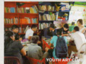
YOUTH ART CLUB

To augment the arts program, two volunteers from Give Kids A Chance conducted art workshops with every grade from kindergarten to Grade 8.