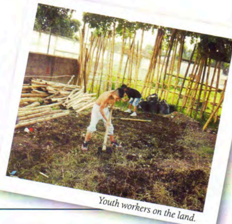
Youth workers on the land.

Please donate to help us continue our work. 100% of your donations will be used to create opportunities for these children. Thank you for your support in the past.