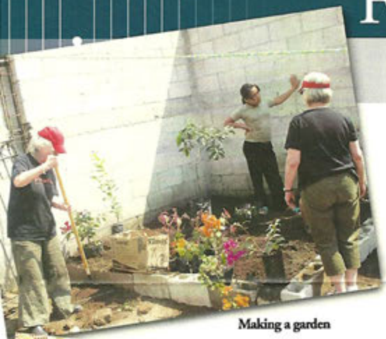
Making a garden