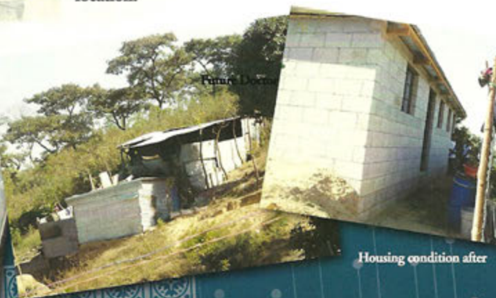
Housing conditions before