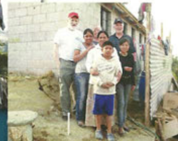
Our family's new house