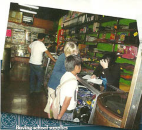
Buying school supplies

Give Kids A Chance is helping three impoverished families in Guatemala. In late 2009 we assisted one family by building a simple block house in a secure location. They are now able to concentrate on their education without living in a dangerous and violent location.